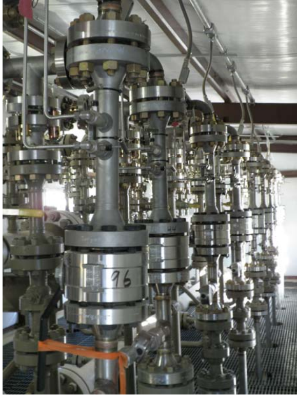
Figure 2: Installed V-Cone Flowmeters

A stainless steel piping split run was installed from the CO 2 gas and water sources to support 16 well heads (Fig 2).