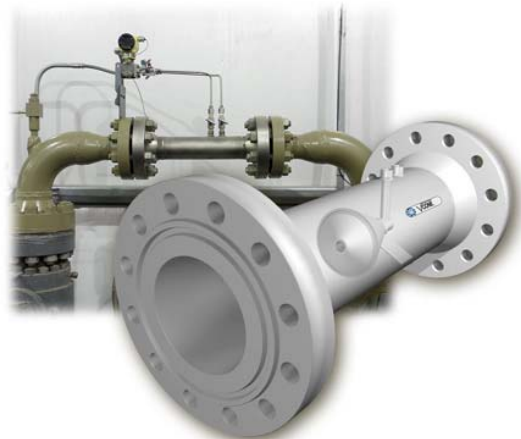
Figure 1: The V-Cone ® Flow Meter as a master meter

In this particular WAG system, the process engineers required a flow meter to be installed as a master meter at the source tanks for CO 2 and water ( Fig. 1 ).