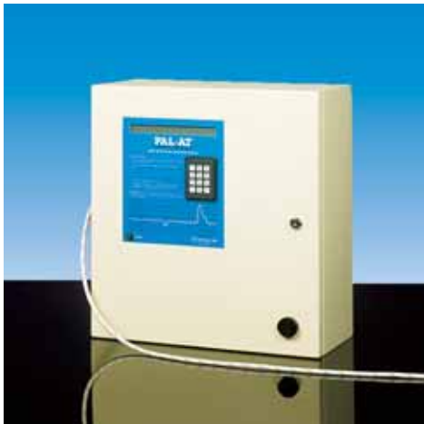
PAL-AT Leak Detection/Location System

The steel service pipe is insulated with mineral wool insulation and contained within a drainable, dryable, pressure testable steel conduit. This combination alone would be an excellent piping system, but we also corrosion coat the conduit, insulate it with polyurethane foam and jacket it with fiberglass. This union is formed to complete the highest quality, waterproof, corrosion resistant, high strength, thermally efficient system available.